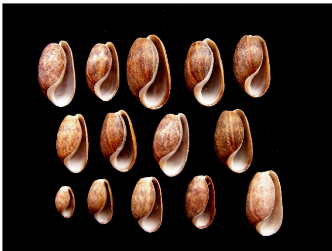
Bulla striata – Sanaray / France (own collection / findings)

The following pictures show findings of Bulla striata which I personally found when snorkelling at Sanaray/France. All shells were already without inhabitants.