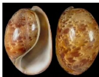
Bulla striata Italy

Same species from different locations, showing different designs