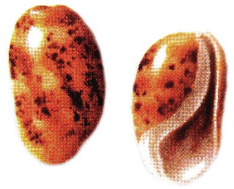
Bulla punctulata (3-299/4) Pacific

The following pictures show findings of Bulla striata which I personally found when snorkelling at Sanaray/France. All shells were already without inhabitants.