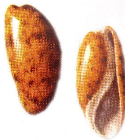
Bulla striata (3-299/3) Mediterranean