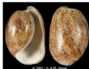
Bulla ventricosa Philippines