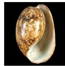
Bulla ventricosa Philippines

These examples (again ex G. Poppe from Philippines) all have different names. Even when looking very carefully I have problems to see any differences.