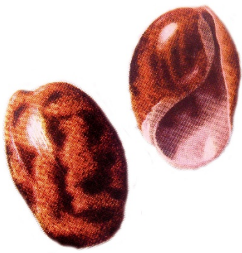
Bulla ampulla (3-299/2) Indo-Pacific

The following pictures of Bulla spec. (according to G.Poppe/ Philippines) should have been a trial to check whether name giving is not only a problem for fossils.