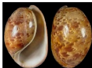
Bulla striata Italy