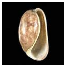
Bulla striata Italy