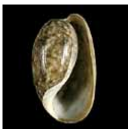
Bulla striata Venezuela