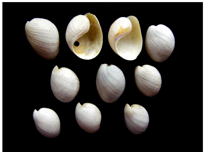
RSA_A07 006 South Africa

Some other examples. Only RSA A07 006 (above right) shows a bit more difference in size.