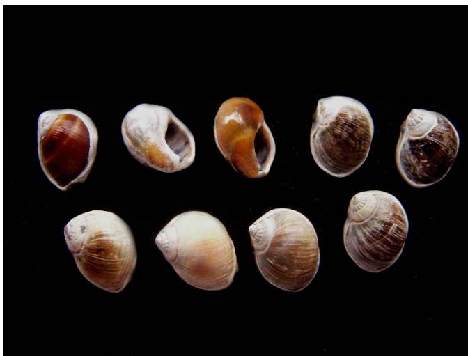
RSA_A07 005 South Africa